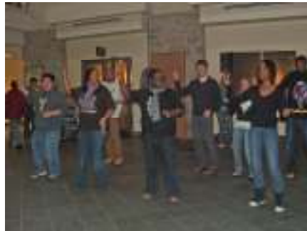
Members of CUBE at the 2009 Black History Month Opening.