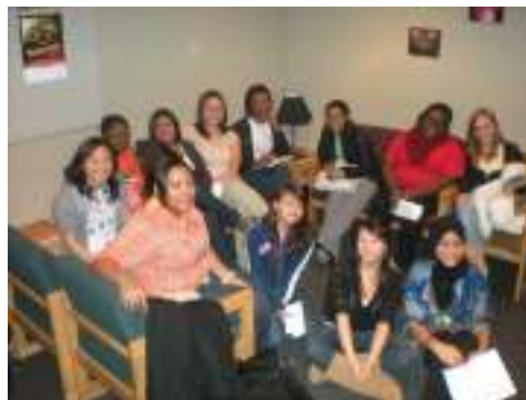
Women of Color Group Members get ready to perform at "The Loudest Form of Silence"