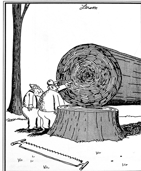
"And see this ring right here, Jimmy? ... That's another time when the old fellow miraculously survived some big forest fire."