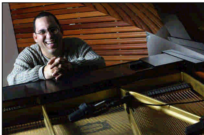
Cuban-born pianist Nachito Herrera at the keys.

Herrera, 37, describes Puro Cubano as "an experiment around Cuban music," melding influences from a variety of diverse traditions. The end result is a uniquely modern sound with solid roots in North American jazz harmonies and catchy Afro-Cuban rhythms. At Thursday's show, the four-member Puro Cubano performed a mix of original songs and jazz standards.