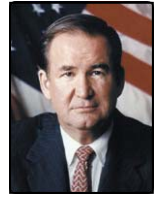
ACLU President Nadine Strossen and 2000 Presidential candidate Pat Buchanan came to St. Olaf on Nov. 18 for a civil liberties debate.