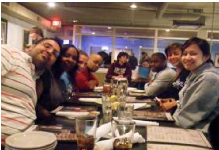
SSS students and staff enjoying dinner in Chapel Hill.