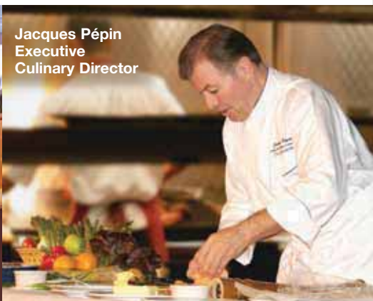
Jacques Pépin Executive Culinary Director