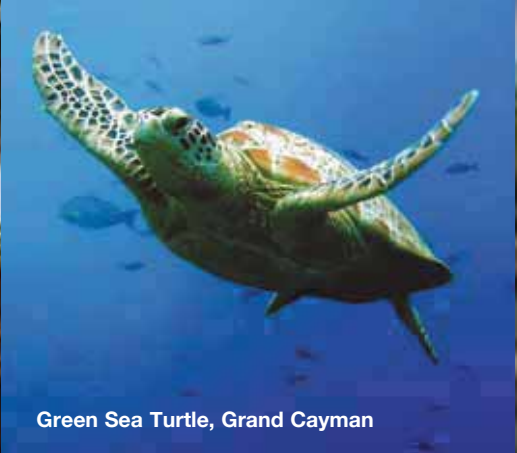
Green Sea Turtle, Grand Cayman