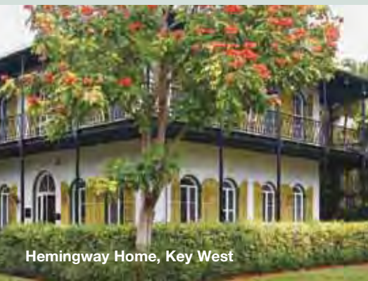
Hemingway Home, Key West

In each port of call you may select from a variety of optional shore excursions for an additional charge, some of which are referenced in the descriptions above.