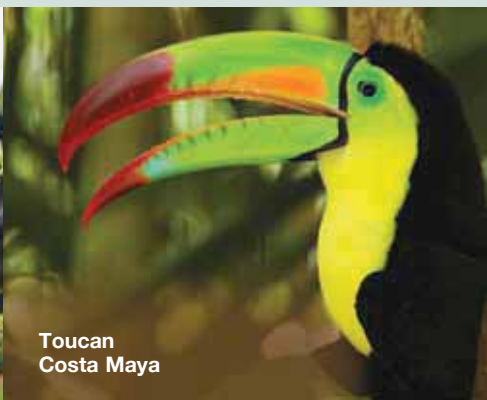
Toucan Costa Maya