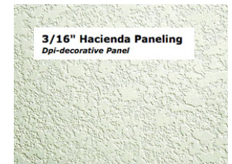
4x8 panel covering- Menards